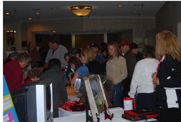
Double-checking the next session locations