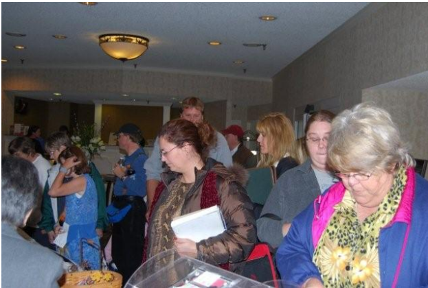
Charting Your Future Attendees picking up their registration packets

The Council hosted a learning event on self-directed services and self-determination in September of 2007, titled Charting Your Future . The event was developed to coincide with the Self-Directed Services Waiver submitted by the Department of Public Health and Human Services, Developmental Disabilities Program.