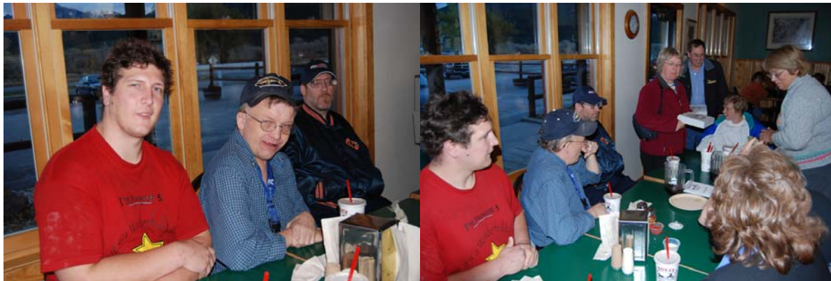
Members of the Livingston Chapter of People First of Montana

The Council provides the majority of financial support for this self-advocacy organization with Chapters located across the state. A funding shift approved by the Council in June of 2007, provides financial support to each, individual Chapter. Chapter members develop their own budgets and make all the decisions as to how their funding is expended. Currently there are 13 Chapters of People First active in Montana.